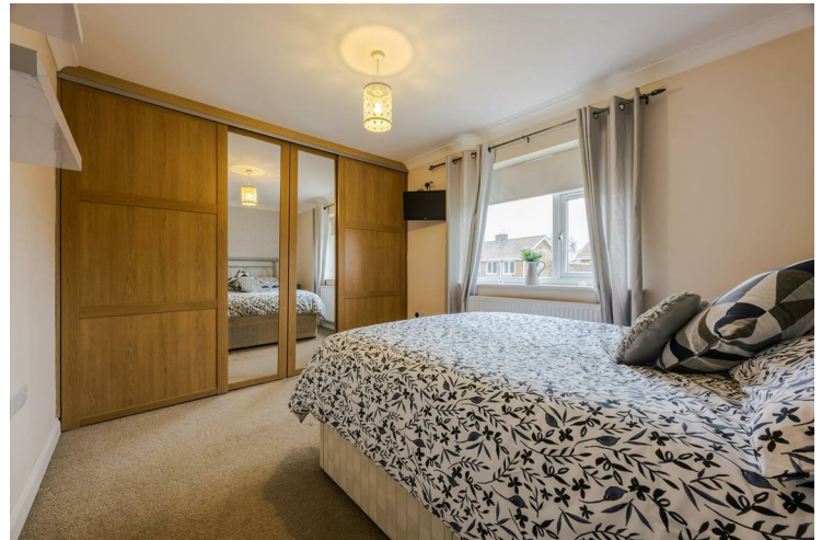
Bedroom three 11'2" x 9'6" (3.41 x 2.92)