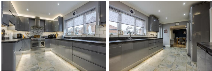
Utility room 12'0" x 5'9" (3.66 x 1.76)